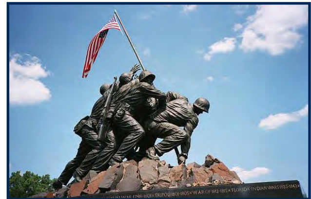
Iwo Jima Memorial