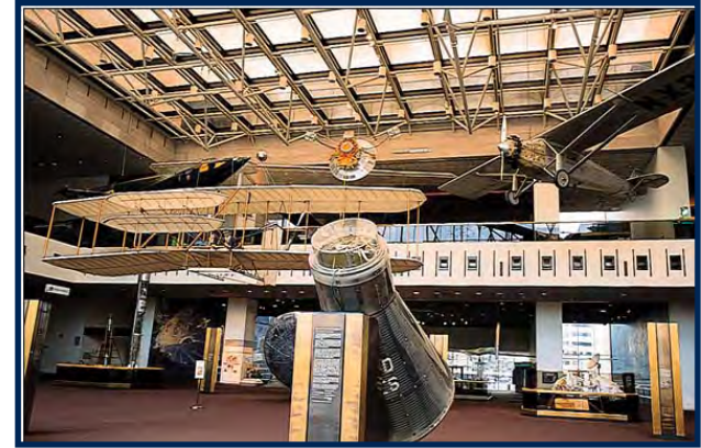
National Air & Space Museum