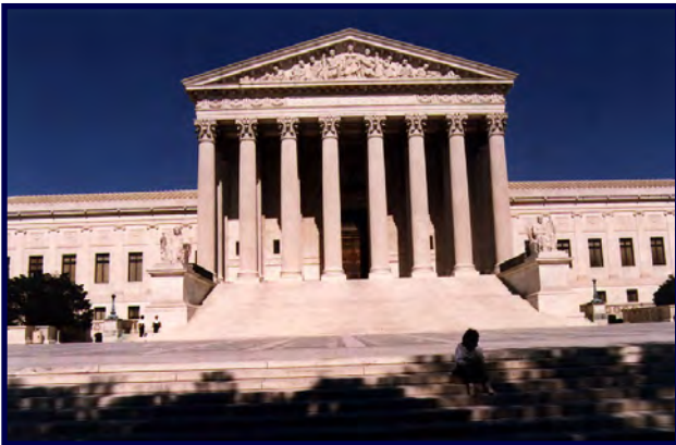
U.S. Supreme Court